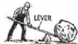
Man lifting a stone with a lever

a lever. The other end moves up and pushes against whatever you